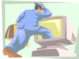
New Communications Committee Forms

At the July Board of Directors meeting, a motion to form a new Communications Committee from the existing Web Committee and Newsletter Committee was carried. The two committees will now com-